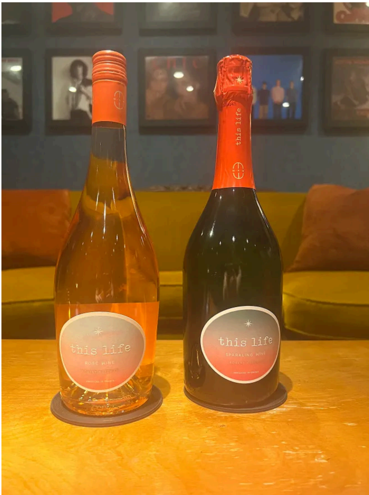
This Life 2024 Rosé (l) and a Crémant from Maison Wessman at Electric Lady Studios, New York City

Maison Wessman is also working with another musician, Kaleo frontman JJ Julius Son, on a wine collection. Both grew up in Mosfellsbæri, Iceland, a small